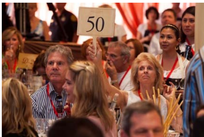
Frenzied bidding led to a new record total

Auction Napa Valley, the annual charity auction, has raised US$18.7m, exceeding the record previously set last year of US$16.9m.